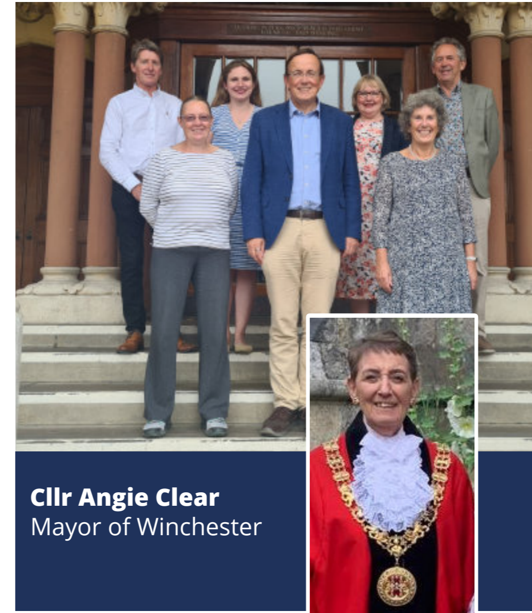
Cllr Angie Clear Mayor of Winchester